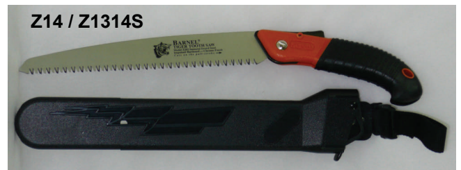
Z14 / Z1314S

Please talk to us about your requirements